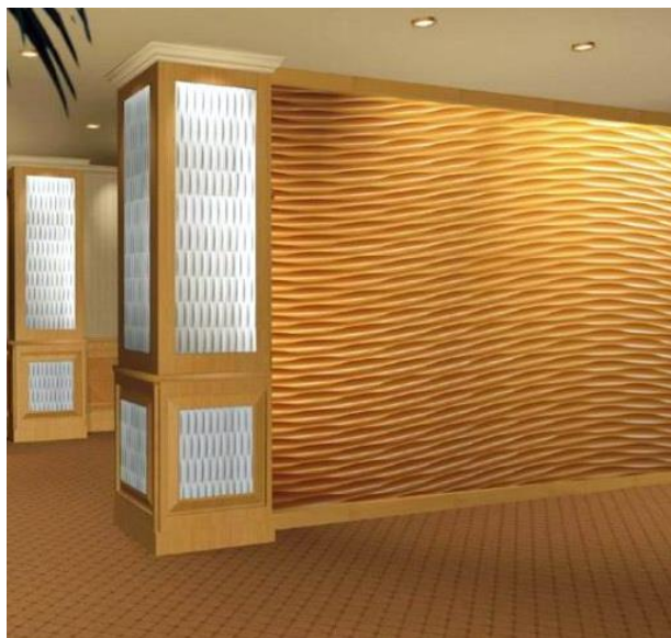
PICTURE SAMPLE OF PROPERLY INSTALLED PANEL

When the panels properly aligned, once they are filled with on the edges, sanded, primed and painted, the seam should not be visible like the picture below that shows three panels side by side: