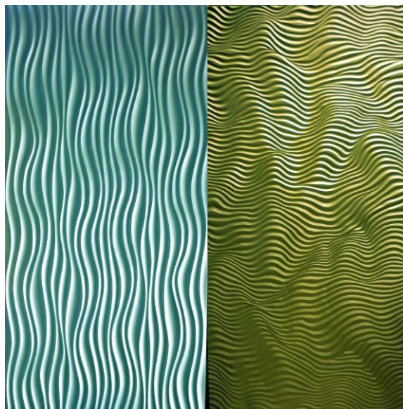
VERTICAL FLOW HORIZONTAL FLOW

Panels come in both horizontal and vertical direction and while this has no impact in the way the pattern flows on the installation, it matters on certain applications as well as for ordering purposes.