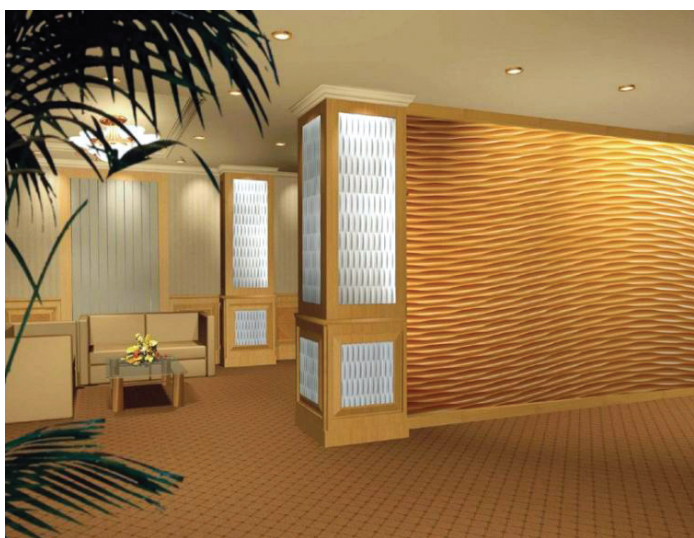
PICTURE SAMPLE OF PROPERLY INSTALLED PATTERN

When the panels are properly aligned, and they are filled with filler on the edges, sanded, primed and painted, the seam should not be visible like the picture below that shows three panels side by side: